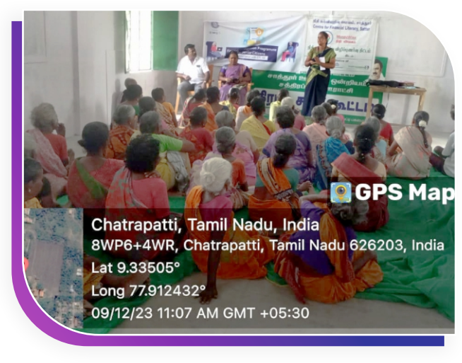
9th December 2023 Sattur, Virudhunagar