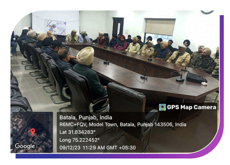
Police Personnel, Batala - Punjab