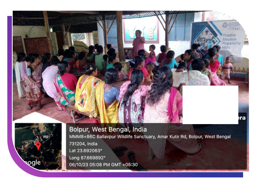
Rural Women, Bolpur - West Bengal