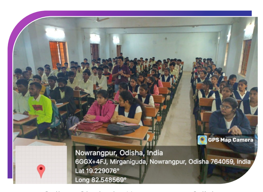
College Students, Nowrangpur - Odisha