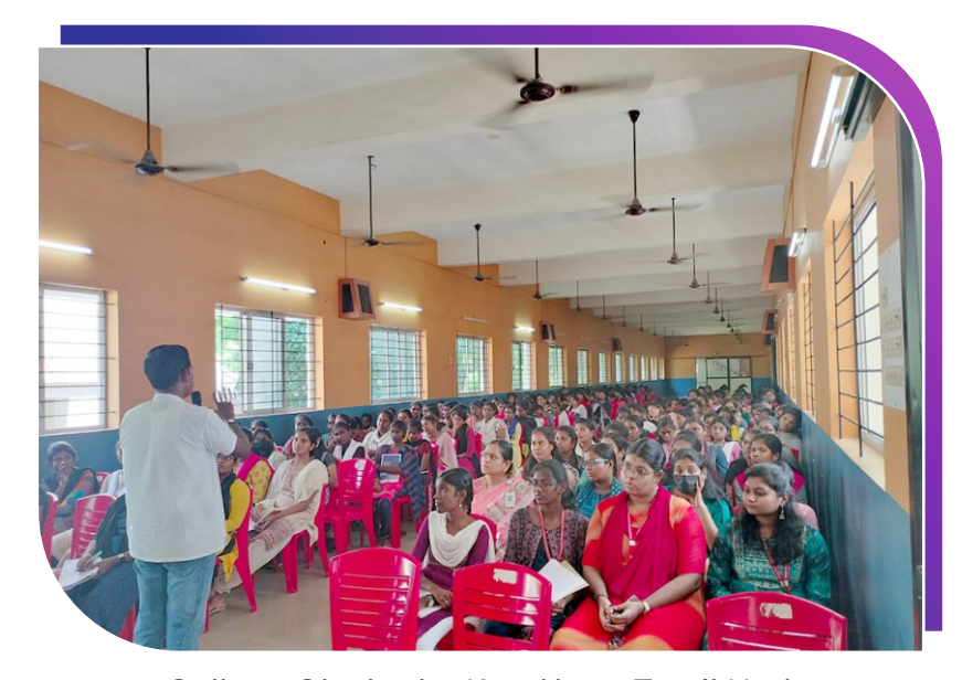
College Students, Korattur - Tamil Nadu