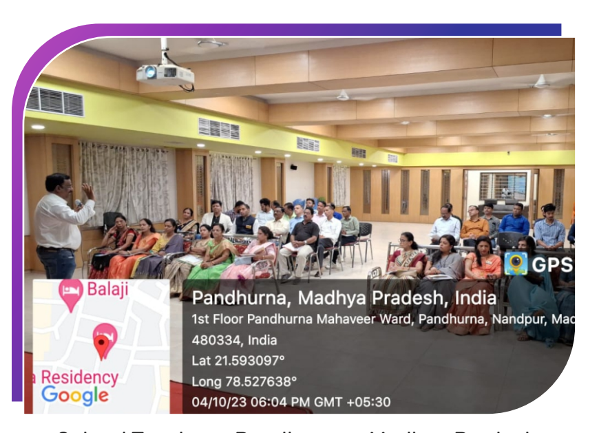
School Teachers, Pandhurna - Madhya Pradesh